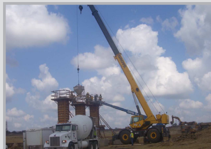
Column Construction at SH 130/US 183 Interchange