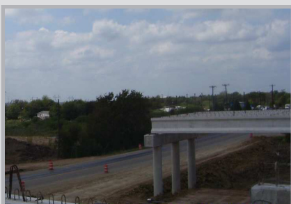
Concrete Beam Placement at FM 812

Other activities include concrete paving in various locations