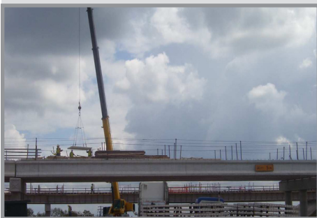
Deck Panel Placement SH 130 Mainlane over McAngus Road