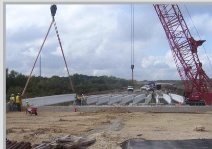
Concrete Beam Placement SH 130 frontage road over Dry Creek (north fork)

between Onion Creek and Elroy Road and continued work on the mainline and ramp toll plazas.