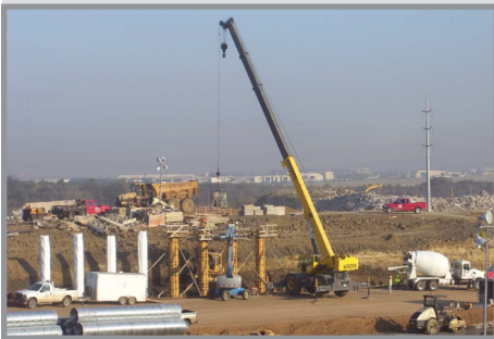
Bridge Column Construction at Elroy Road