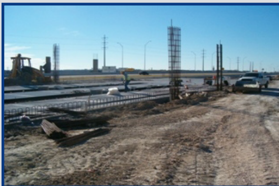
New Westbound Entrance Ramp at Heatherwilde Blvd.