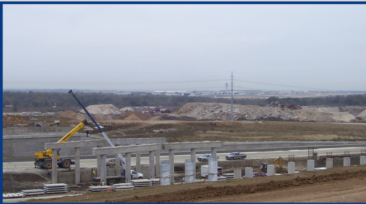
Underpass/Substructure Work at Elroy Road