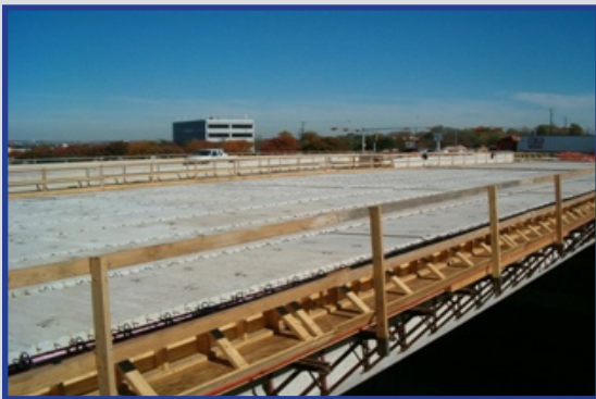
New Hesters Crossing Bridge