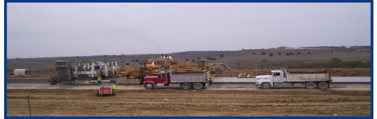
Paving Operations at Moore Road