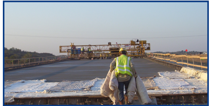
SH 130 Northbound Mainlane Over North Fork Dry Creek