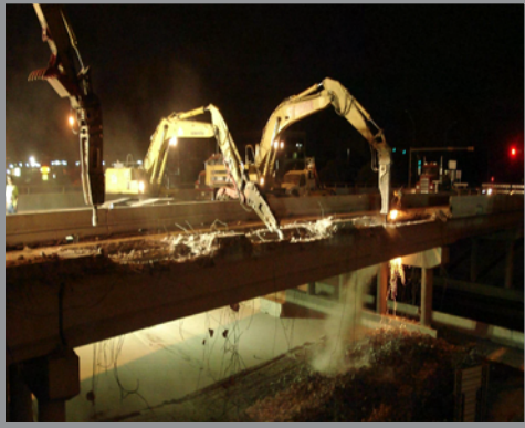
Beginning Bridge Demolition

Additional detours of southbound I-35 traffic in the area will occur periodically for the remainder of 2007 to accommodate construction of the new bridge and collector-distributor roadways. To the extent possible, work will be scheduled on weekends and at night. In addition to posting future detours on the centraltexasturnpike.org website, an information line, 512-225-1503, has regular updates on detour plans.