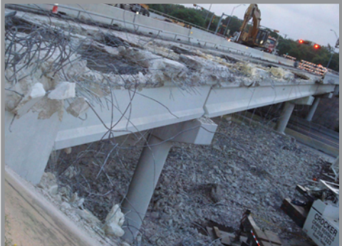
Preparations to Remove Bridge Beams

around the demolition work. On northbound I-35, the inside mainlane was closed. The bridge and mainlanes were re-opened Saturday night.