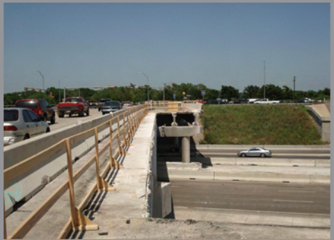
Hester's Crossing Bridge, Sunday, June 10, 2007