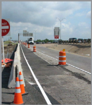
I-35 southbound exit widened to two lanes for construction detour

Demolition of the southern portion of the bridge began at midnight on Friday, June 8 th and continued on Saturday. During demolition, the Hester's Crossing Bridge was closed to thru-traffic. Southbound I-35 mainlane traffic was detoured in two lanes onto the frontage roads