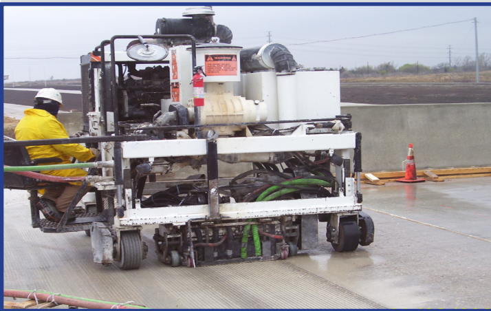
Bridge Deck Slab Grooving Operation Elroy Road Bridge over SH 130

With the opening of SH 130 Segment 4, all of the Central Texas Turnpike System 2002 Project will be open to traffic. Work will continue through the next few months on completing the SH 130/US 183/SH 45SE interchange. Construction of SH 45SE from SH 130/US 183 west to I-35 is underway and scheduled for completion in the Spring of 2009. Right of way acquisition for extension of SH 130 through Caldwell and Guadalupe counties to I-10 near Seguin is in progress, and construction on this portion of SH 130 is expected to begin in 2009. Visit www.mysh130.com for additional information on the Caldwell/Guadalupe county segments of SH 130.