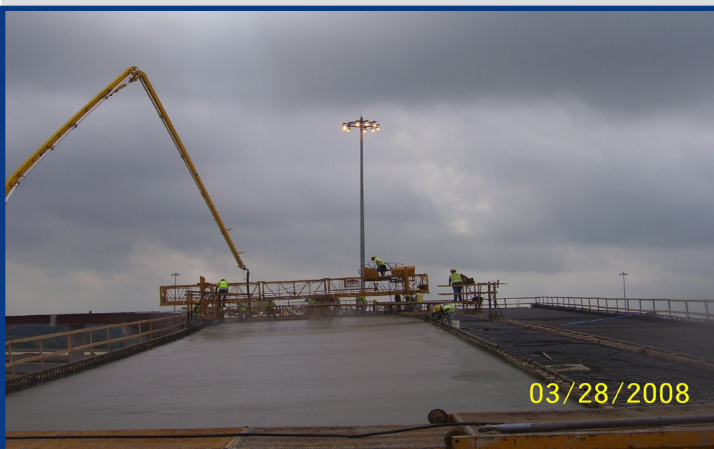
Deck Slab Placement SH 130/SH 71 Direct Connector

During March, the Developer also completed the striping for new lanes at the SH 130/US 290 interchange; all lanes are now open (Segment 2). In Segment 3, bridge crews completed erecting the steel girders on the SH 71/SH 130 direct connector and began preparations for placing the final remaining riding surfaces.