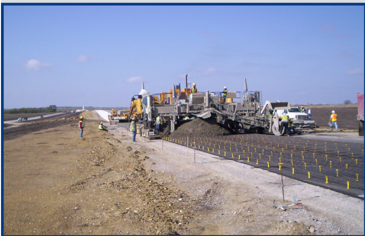
Paving Operations, Northbound Mainlanes between Maha Loop and US 183

During March, asphalt was placed at Maha Loop, Moore Road, and the US 183 northbound frontage road. Concrete