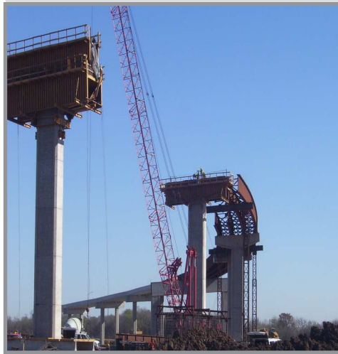
Column and Cap Work at the SH 71 Direct Connector