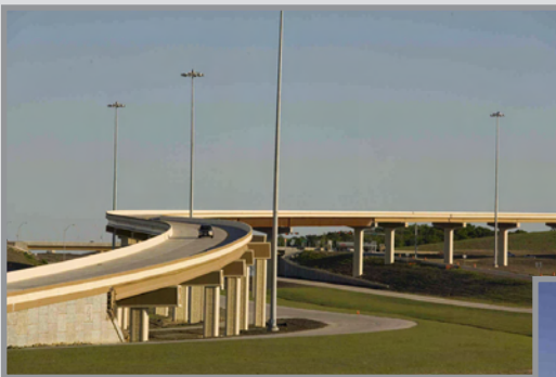
Photos of SH 130/Pickle Parkway

Congressman Pickle represented Central Texas from 1963 to 1995 and was known and respected for his commitment to the region’s economic health and vitality.