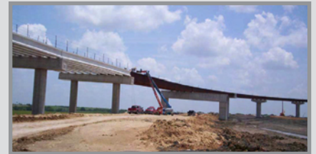
Bridge superstructure work at SH 130/SH 71 Interchange

the SH 130 alignment to the future SH 130/US 183 intersection.