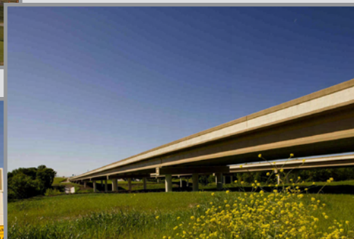
TOP LEFT: at US 290 BOTTOM LEFT: at SH 45N ABOVE: at the San Gabriel River