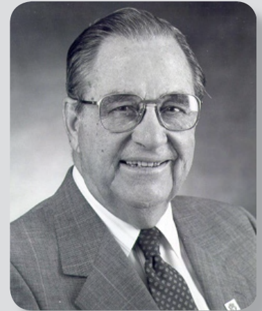
Congressman J.J. “Jake” Pickle

An early and staunch proponent of an I-35 alternative in the busy Austin-San Antonio corridor, Congressman Pickle was instrumental in creating and ushering through the U.S. Congress federal legislation that included support for SH 130. Through his efforts, the early federal funding for SH 130 feasibility and environmental studies was secured.