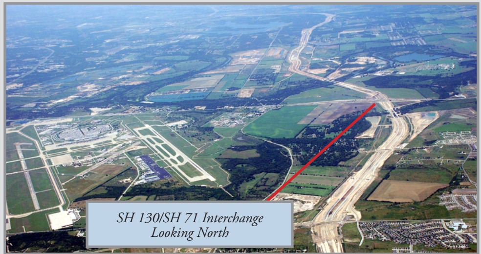
SH 130/SH 71 Interchange Looking North

This segment of SH 130 is 11.5 miles long and includes six intersecting roads—Blue Bluff Road, Bloor Road, FM 973, FM 969, Harold Green Road, and SH