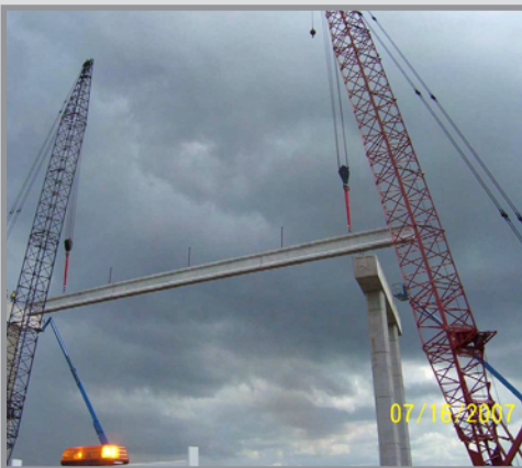
Concrete Beam Placement SH 130 at SH 71

A collector-distributor (CD) roadway system that has been under construction along SH 45N near Parmer Lane will be completed and open to traffic by August 25, 2007 when toll collection on SH 45N between US 183 and Loop 1 begins. The project included construction of the CD roadways as non-tolled lanes for RM 620 traffic under Parmer Lane and a pair of non-tolled entrance and exit ramps for access between the SH 45N frontage roads and the CD roads. The project provides a non-tolled alternative for RM 620 traffic to avoid the frontage road intersection at Parmer Lane.