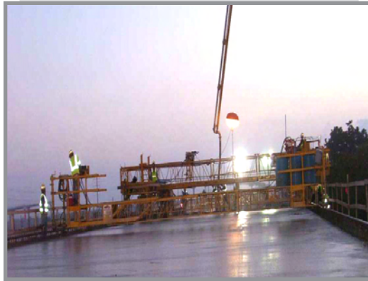
Concrete Deck Placement, SH 130 Northbound Mainlane over Onion Creek