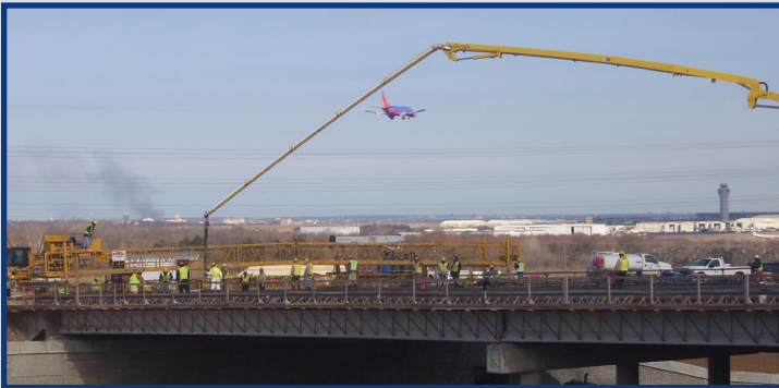
Bridge Deck Placement, Elroy Road Bridge over SH 130