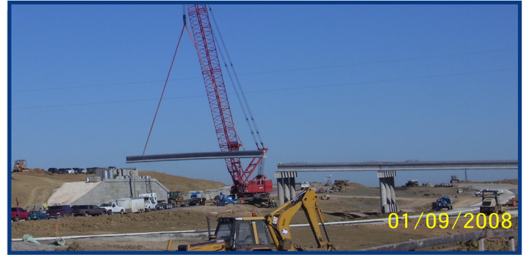
Placement of Type IV Beams, Moore Road Bridge over SH 130