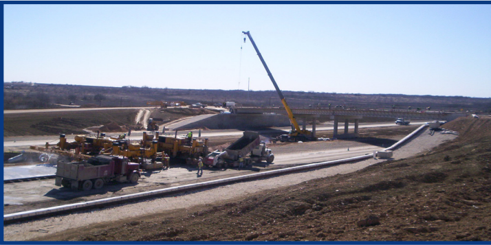
Concrete Paving Operations, SH 130 at Moore Road

Fork Dry Creek, the northbound frontage road over Lorena Tributary, the southbound mainline over Von Quintus Road, and the US 183 bridge over Maha Creek. All remaining bridges in Segment 4 have concrete beams erected and concrete panels in place.