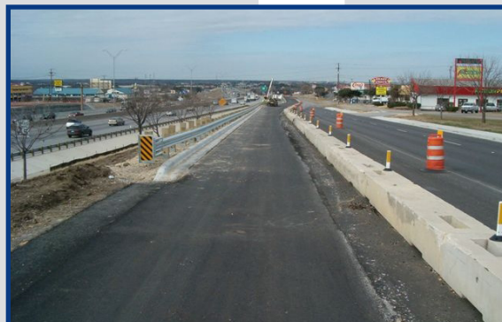
New Alignment of the I-35 Northbound Frontage Road at Hesters Crossing Boulevard

Work continues in Section 4 on the Hesters Crossing roadway improvements, including the new alignments of northbound Mays Street and the I-35 northbound frontage road. Concrete paving and roadway illumination work continues at the new ramps at Heatherwilde Boulevard in Section 6.