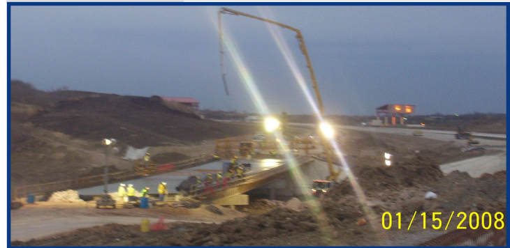
Bridge Deck Placement, SH 130 Northbound Frontage Road over South Fork Dry Creek