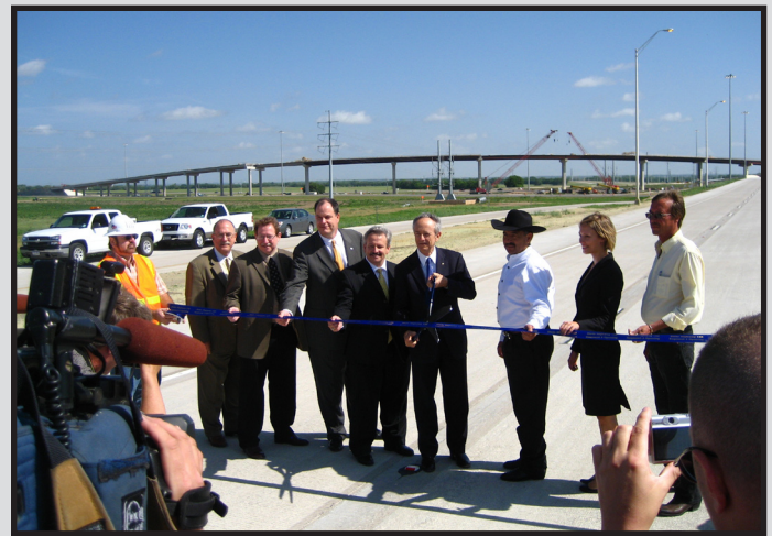
Cutting the Ribbon for Opening SH 130 Segment 4

and beginning construction of the SH 130 extension from US 183 south through Caldwell and Guadalupe counties.”