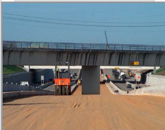
Flex Base Placement on the SH 45/RM 620 Collector-Distributor Near Parmer Lane