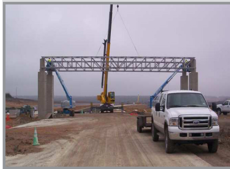
Gantry Construction, Segment 3 Mainlane Toll Plaza