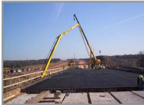
Concrete Placement, Decker Creek Bridge