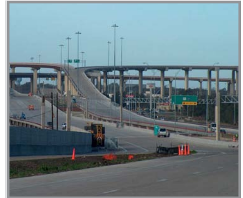
SH 45N at US 183 Looking West

bridge and sign columns are being poured throughout the project. Other activities include miscellaneous work at the North Branch, main, south and north detention ponds. Landscaping around the toll plaza eastbound frontage road is underway. Sawcutting sensor array loops on the eastbound toll tag lanes is complete and work is beginning on the westbound toll tag lanes. Traffic rail work continues on the retaining walls and parapet walls, and striping is ongoing.