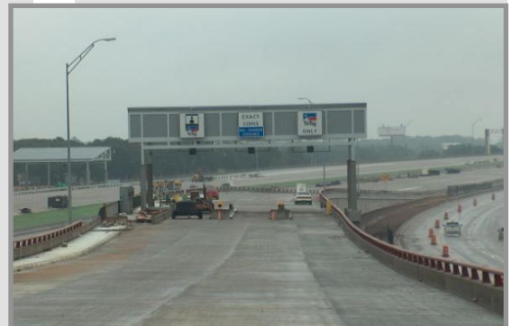
Ramp Toll Plaza - Eastbound Entrance Near RM 620, East of Parmer Lane

northbound direct connector bents. Painting of columns and beams, prepping topsoil, and seeding work is ongoing.