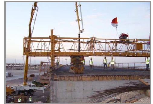
Paving Operations, SH 130 at SH 45N