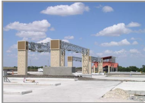
Mainlane Toll Plaza Near CR 107