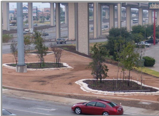
Landscaping at the SH 45N/I-35 Intersection