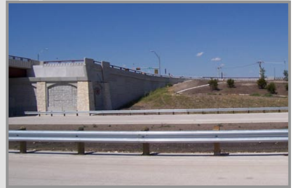
SH 45N at Heatherwilde Boulevard