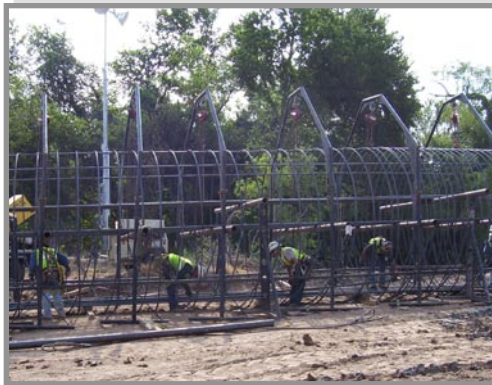
Drilled Shaft Construction for an Austin Energy Transmission Line