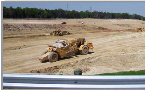
Excavation following traffic switch to the new FM 973 bridge

have been constructed for the Segment 4 mainlane toll plaza.