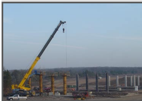
SH 130 Bridge Sub-Structure Work over Decker Creek

northbound and southbound SH 130 over US 79 interchange.