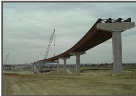
Direct Connector, SH 130 @ US 290