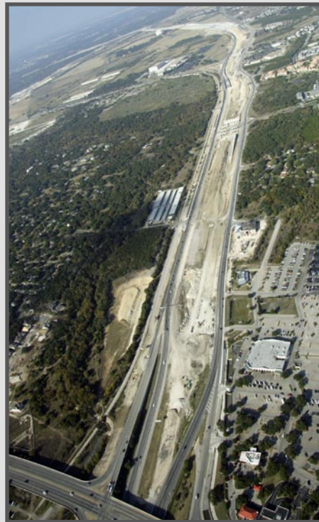
Loop 1 Extension Looking North (Parmer Lane in lower foreground)