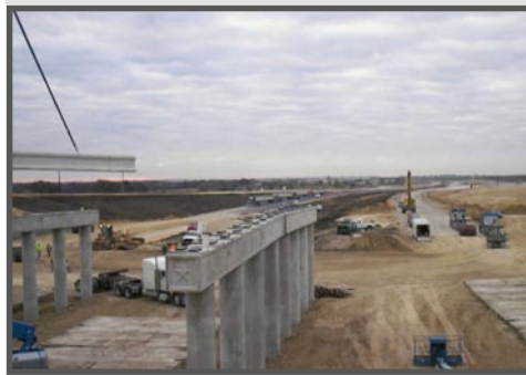
SH 130 @ SH 29