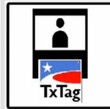
Figure and an illuminated green light indicate that an attendant is available.

This booth is not staffed, but takes exact coins and has a bill changer.