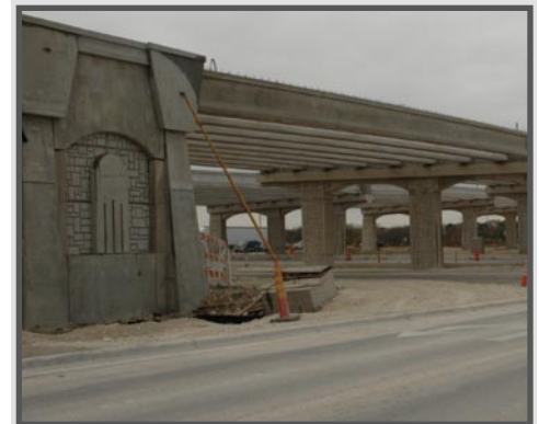
SH 45N @ A.W. Grimes Blvd. Section 5