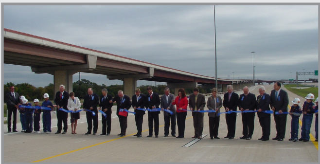
CTTS Ribbon Cutting Ceremony, November 1, 2006