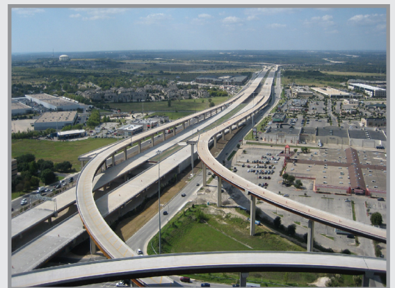
SH 45N at I-35, October 31, 2006