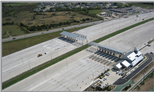
Loop 1 Extension Mainlane Toll Plaza, October 2006