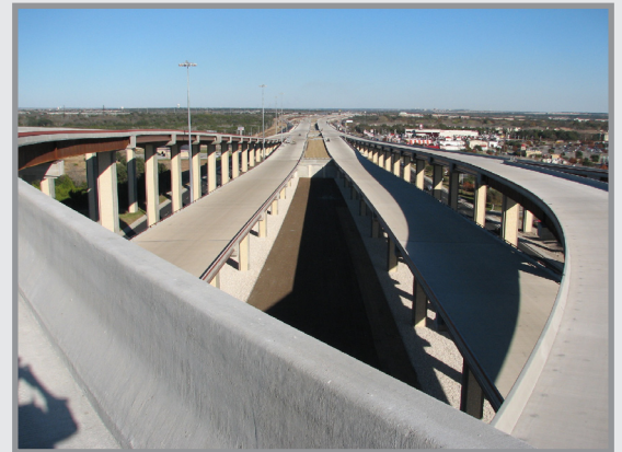
SH 455 at US 183, December 2006