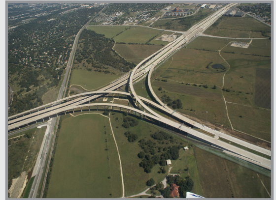
SH 45N/Loop 1 Interchange, October 2006